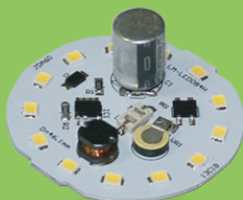
DOB Driver on Board